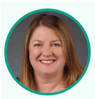
The Honourable Natalie Hutchins Minister for Education & Minister for Women